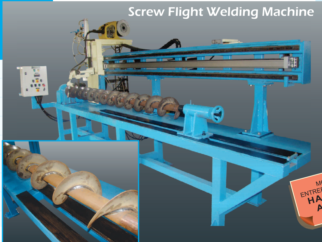
Screw Flight Welding Machine