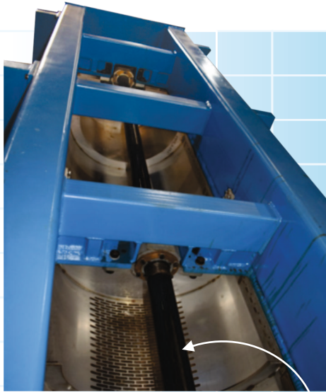
Boring bar holding tool at Baffle position